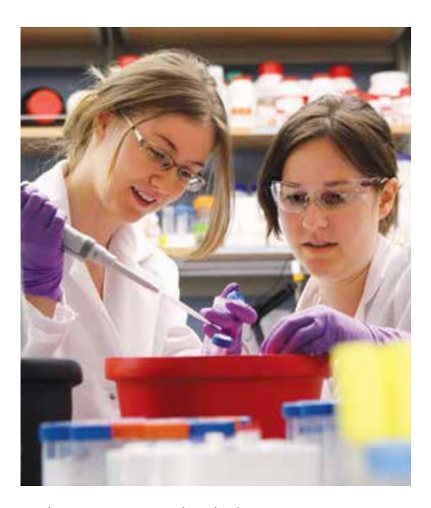
Students pursue research with Alumnae support.